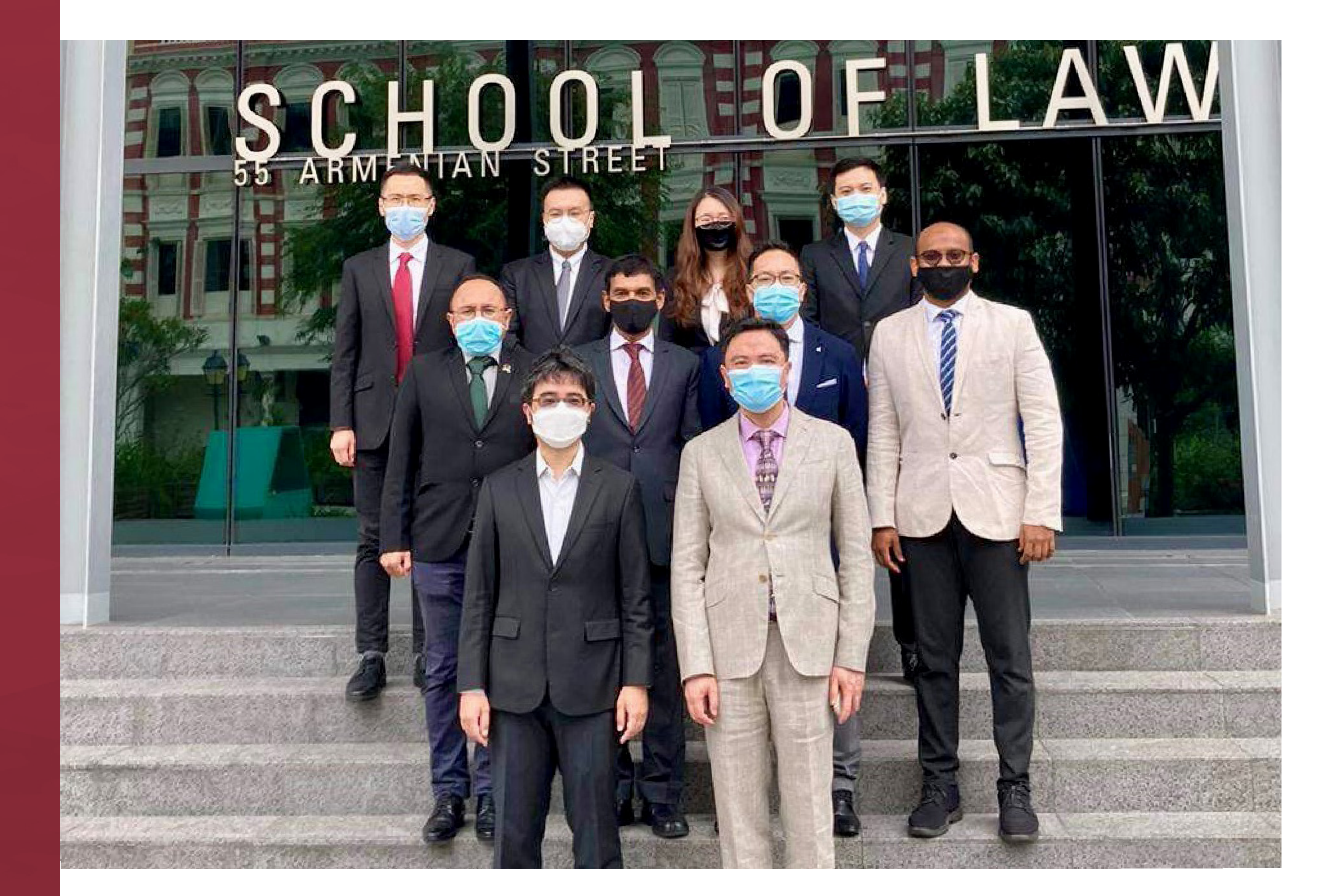
Short training sessions (right) and full-fledged master's programmes (above) are among the courses offered by the SJC.